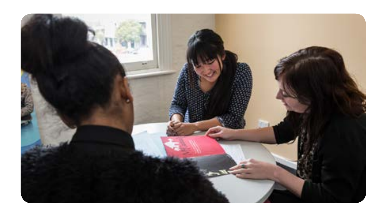
Priority 2: To support and sustain a robust, vibrant, independent and innovative not-for-profit sector